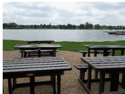
View of Homestead Dam